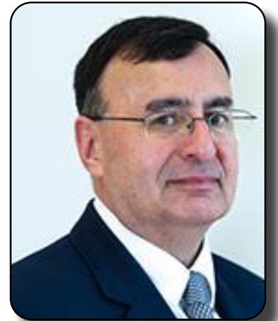
Dr. Carlos Zarate, Jr.

The National Academy of Inventors is a member organization comprising U.S. and international universities, and governmental and non-profit research institutes, with over 4,000 individual inventor members and Fellows spanning more than 250 institutions. The 2024 Fellows hail from 135 research universities, governmental and non-profit research institutions worldwide and their work spans across various disciplines. They are not only phenomenal researchers holding prestigious honors and distinctions but are also incredible inventors who collectively hold over 5,000 issued U.S. patents and whose innovations are making significant tangible societal and economic impacts today and will well into the future.