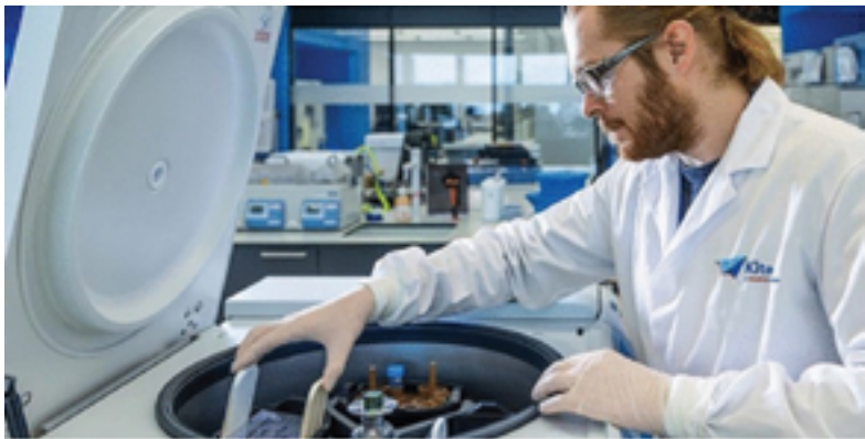
Manufacturing Yescarta® at Kite Pharma

Congratulations to our intramural investigators and their technology transfer programs for such an impressive showing!