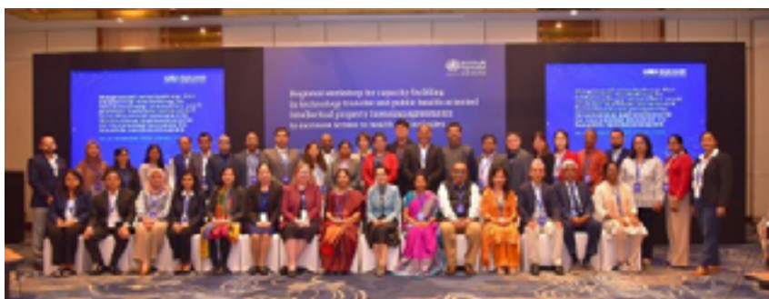
WHO-SEARO Meeting Attendees

The highlight of this trip for me was the chance to meet and engage with so many dedicated public