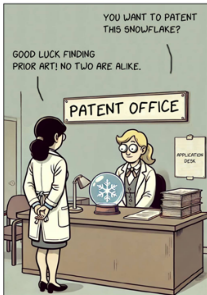
SNOW GLOBE COMPANIES NOW HAVE TO PAY A ROYALTY EVERY TIME YOU SHAKE ONE UP